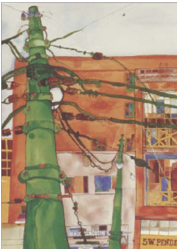
Pender & Carrall Original 22" x 24"