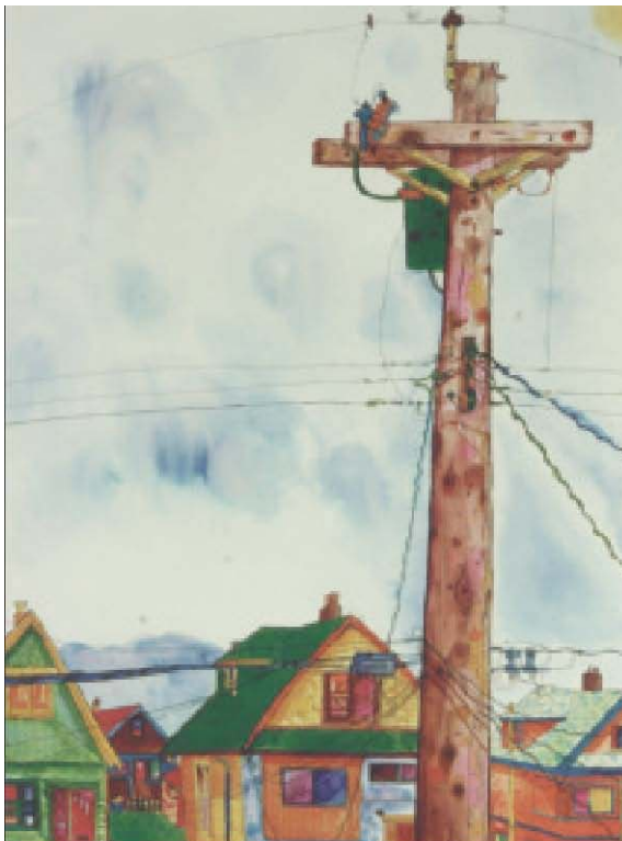
Eastside Pole Original 22" x 24"

I endeavour to give spirit to that which might only be set apart by a mundane definition of what is alive or dead: any object becomes an objet d'art when given attention.