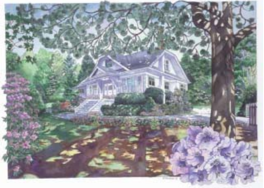
Pena Residence Original 22" x 30"

These paintings are very personal. I include all the important things in a person's life and their family's. It can include the cat, dog, the favourite plant and flower, the radial arm-saw, the wheelbarrow, whatever your heart desires!