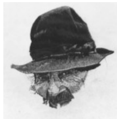
Tonal Drawing Exercise

I show these examples because they are typical of the kind of progress made. I regard drawing technique as a form of literacy as opposed to an endowed talent, and the students are encouraged to use the technical knowledge for personal expression, not as an end in itself. I am an encouraging and playful teacher, and I endeavour to create a warm and safe environment. I find teaching sometimes very exciting and quite often extremely satisfying.